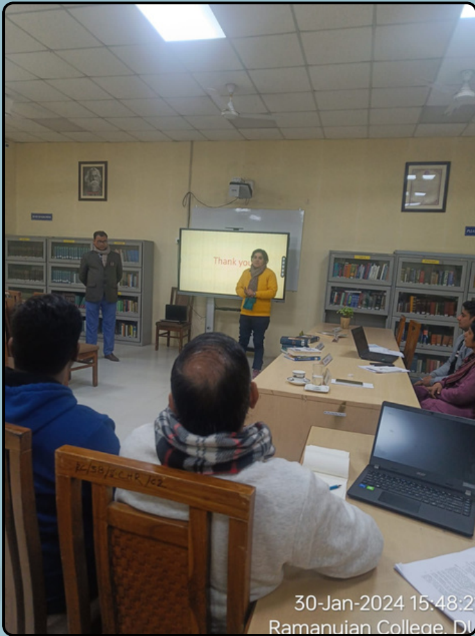
30-Jan-2024 15:48:2 Ramanujan College, DU