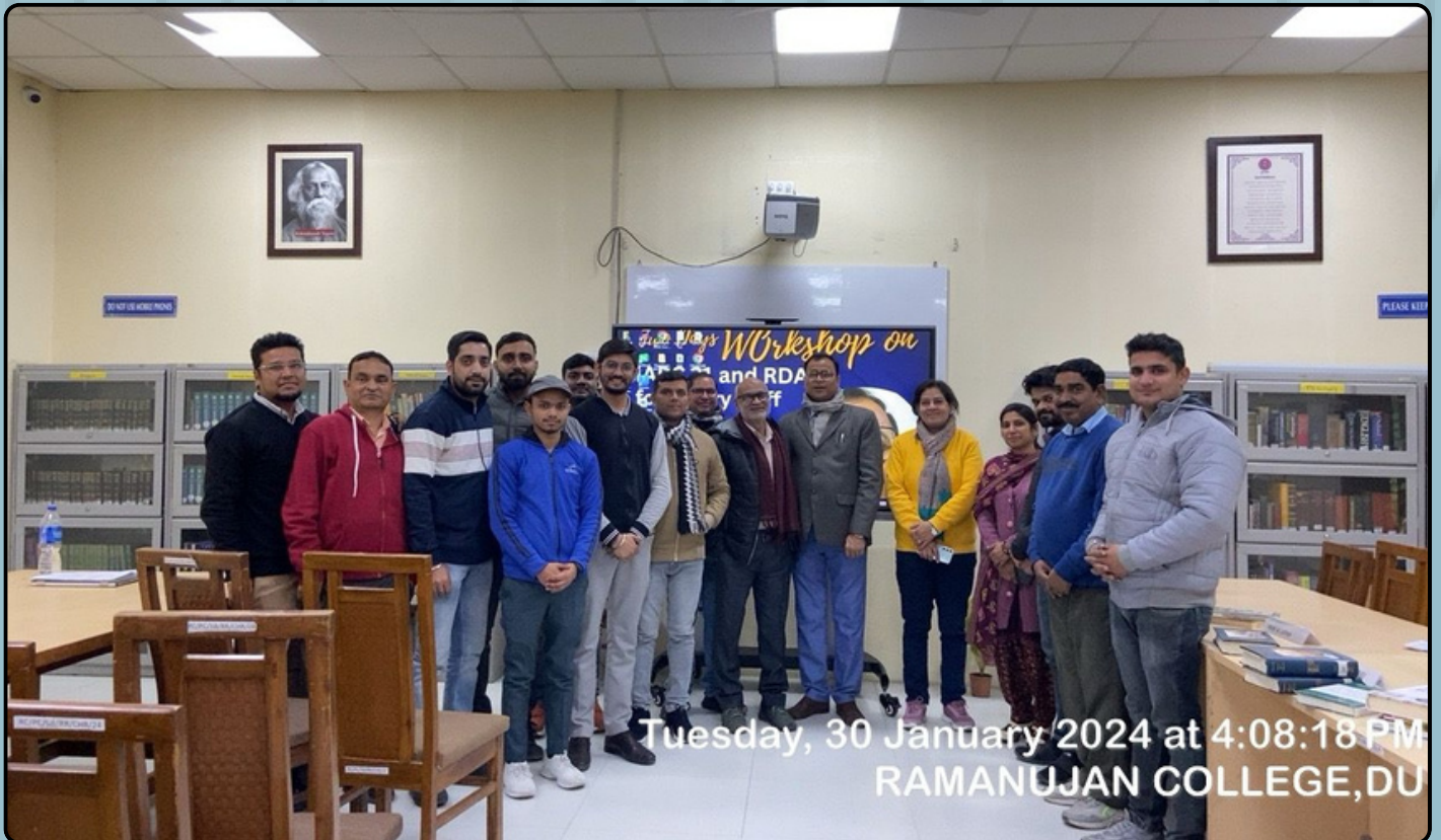
Tuesday, 30 January 2024 at 4:08:18 PM RAMANUJAN COLLEGE, DU