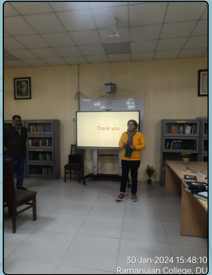
30-Jan-2024 15:48:10 Ramanujan College, DU